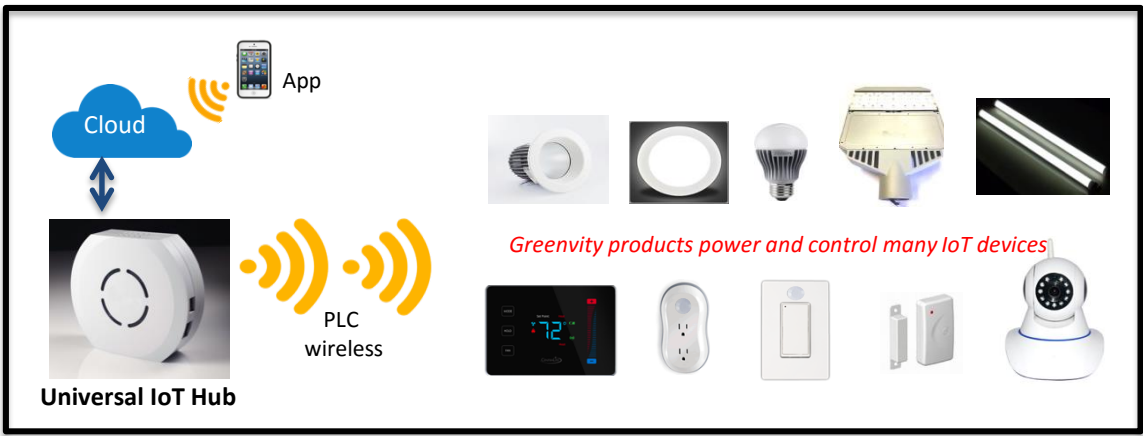
Smart LED Lighting Control with Sensor Network

For more information, please contact Greenvity