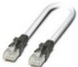
Patch cable, CAT5, assembled, 5 m

Patch cable - FL CAT5 PATCH 5,0 - 2832580