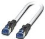
Patch cable, CAT6, pre-assembled, 20.0 m

Patch cable - FL CAT6 PATCH 20,0 - 2891576