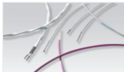
TE Part #CAT-AS22759-32 SAE AS22759: 32/33/44/45/46 - Single-Wall, Lightweight Wire