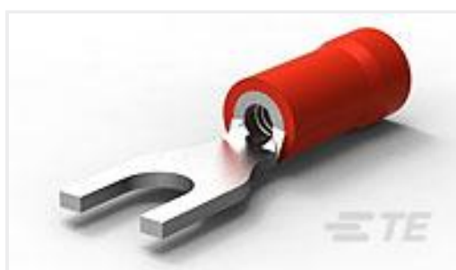
TE Part #171551-2 P.G SPADE