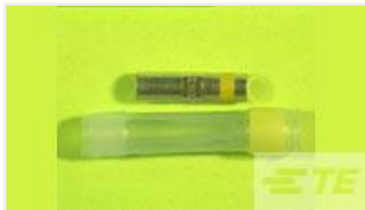
TE Part # 650075-000 D-436-37