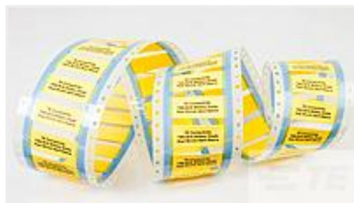
TE Part #4407170001 TMS-SCE-3/32-2.0-4