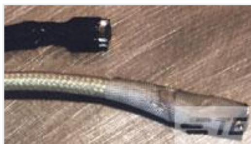
TE Part #4438994002 RT555-3/16-0-SP