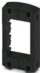
Sealing frame with screw locking, size B10, with flat gasket, for 6 small sleeves

Please be informed that the data shown in this PDF Document is generated from our Online Catalog. Please find the complete data in the user's documentation. Our General Terms of Use for Downloads are valid ( http://phoenixcontact.com/download )