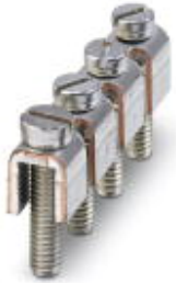
Fixed bridge, number of positions: 4, color: silver

Please be informed that the data shown in this PDF Document is generated from our Online Catalog. Please find the complete data in the user's documentation. Our General Terms of Use for Downloads are valid ( http://phoenixcontact.com/download )