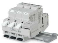
Jumper bar for quick and convenient commoning

Subject to changes. Please also observe the further product documentation!