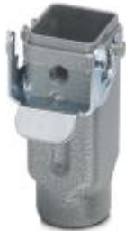
HEAVYCON D7 coupling housing, with single locking latch, height: 60.5 mm, with 1 x M20 gland, zinc die-cast

Please be informed that the data shown in this PDF Document is generated from our Online Catalog. Please find the complete data in the user's documentation. Our General Terms of Use for Downloads are valid ( http://phoenixcontact.com/download )