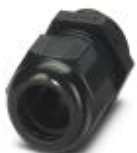
Cable gland, cable gland material: PA, external cable diameter 6 mm ... 12 mm, shielding: no, connecting thread: M20 x 1.5, color: jet black RAL 9005

Cable gland - G-INS-M20-S68N-PNES-BK - 1411133