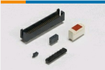
Board-to-Board Headers & Receptacles (1)