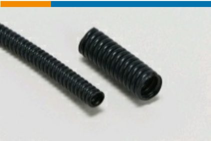
Convoluted Tubing (15)