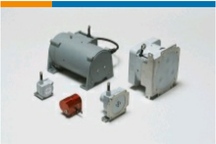
Cable Actuated Position Sensors (17)