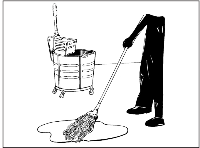
Figure 2. Applying the Statguard® Low Residue Floor Stripper with a cotton mop