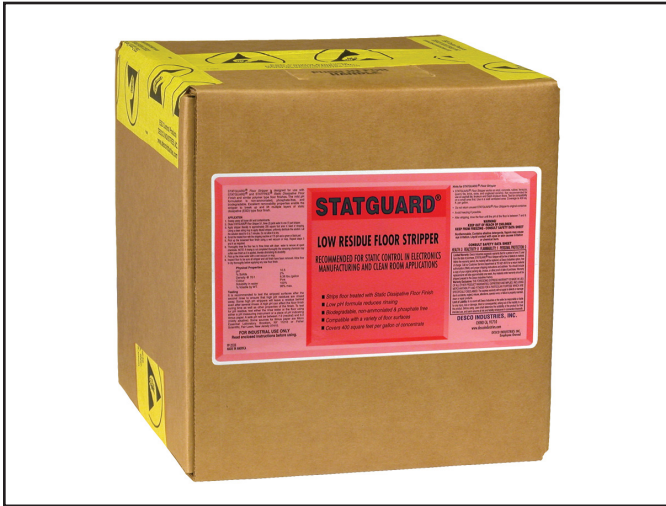
Figure 1. Statguard® Low Residue Floor Stripper