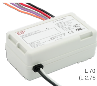
Plastic Case L 70 x W 40 x H 27 mm (L 2.76 x W 1.57 x H 1.06 in)