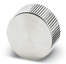
Metal protective cap, M23, series: RC, UC, RF, SF, NC, RM

Please be informed that the data shown in this PDF document is generated from our online catalog. Please find the complete data in the user documentation. Our general terms of use for downloads are valid.