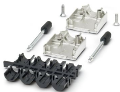
Cable housing for D-SUB-9

Please be informed that the data shown in this PDF document is generated from our online catalog. Please find the complete data in the user documentation. Our general terms of use for downloads are valid.