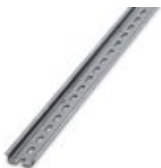
DIN rail perforated, acc. to EN 60715, material: Steel, Galvanized, white passivated, Standard profile, color: silver

DIN rail perforated - NS 35/ 7,5 WH PERF 2000MM - 1204119