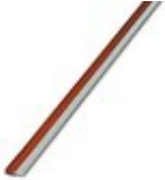
Continuous plug-in bridge, color: red

Continuous plug-in bridge - FBST 500-PLC RD - 2966786