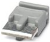
Single plug-in bridge, color: gray

Single plug-in bridge - FBST 6-PLC GY - 2966825