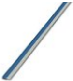
Continuous plug-in bridge, color: blue

Continuous plug-in bridge - FBST 500-PLC BU - 2966692