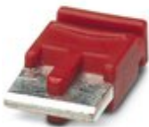
Single plug-in bridge, color: red

Single plug-in bridge - FBST 6-PLC RD - 2966236