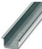
DIN rail, unperforated, similar to EN 60715, material: Steel, Galvanized, white passivated, Standard profile, color: silver

DIN rail, unperforated - NS 35/15 WH UNPERF 2000MM - 1204135