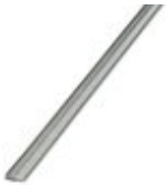
Continuous plug-in bridge, color: gray

Continuous plug-in bridge - FBST 500-PLC GY - 2966838