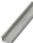
DIN rail, unperforated, acc. to EN 60715, material: Steel, galvanized, passivated with a thick layer, Standard profile, color: silver

DIN rail, unperforated - NS 35/ 7,5 UNPERF 2000MM - 0801681