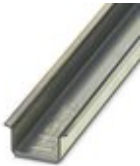
DIN rail, unperforated, similar to EN 60715, material: Steel, galvanized, passivated with a thick layer, Standard profile, color: silver

DIN rail, unperforated - NS 35/15 UNPERF 2000MM - 1201714