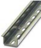
DIN rail perforated, similar to EN 60715, material: Steel, galvanized, passivated with a thick layer, Standard profile, color: silver

DIN rail perforated - NS 35/15 PERF 2000MM - 1201730