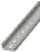
DIN rail perforated, acc. to EN 60715, material: Steel, galvanized, passivated with a thick layer, Standard profile, color: silver

DIN rail perforated - NS 35/ 7,5 PERF 2000MM - 0801733