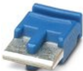
Single plug-in bridge, color: blue

Single plug-in bridge - FBST 6-PLC BU - 2966812