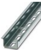
DIN rail perforated, similar to EN 60715, material: Steel, Galvanized, white passivated, Standard profile, color: silver

DIN rail perforated - NS 35/15 WH PERF 2000MM - 0806602