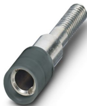
Test plug strip, number of positions: 1, color: black

Please be informed that the data shown in this PDF document is generated from our online catalog. Please find the complete data in the user documentation. Our general terms of use for downloads are valid.