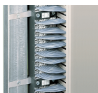
Installation example: Matrix patchboards in a frame