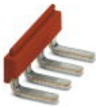
Insertion bridge, pitch: 6.15 mm, number of positions: 4, color: red

Insertion bridge - EB 4- DIK RD - 2716758