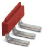
Insertion bridge, pitch: 6.15 mm, number of positions: 3, color: red

Insertion bridge - EB 3- DIK RD - 2716745