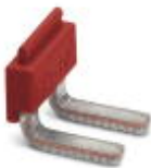
Insertion bridge, pitch: 6.15 mm, number of positions: 2, color: red

Insertion bridge - EB 2- DIK RD - 2716693