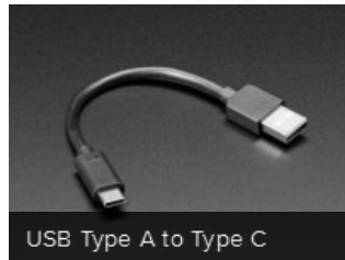
USB Type A to Type C