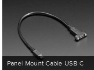
Panel Mount Cable USB C