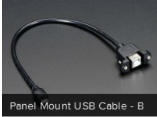
Panel Mount USB Cable - B