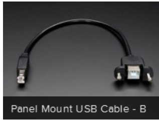
Panel Mount USB Cable - B