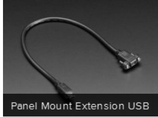
Panel Mount Extension USB