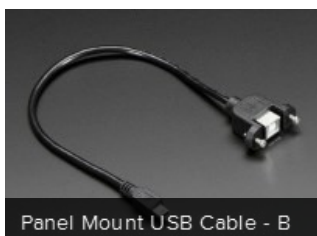
Panel Mount USB Cable - B