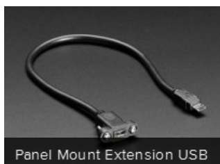
Panel Mount Extension USB