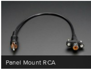
Panel Mount RCA