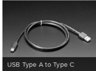
USB Type A to Type C