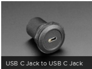
USB C Jack to USB C Jack