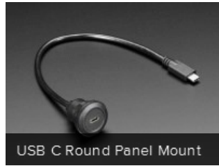
USB C Round Panel Mount