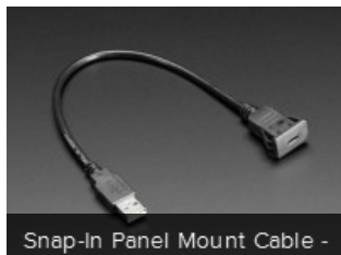
Snap-In Panel Mount Cable -