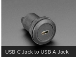
USB C Jack to USB A Jack