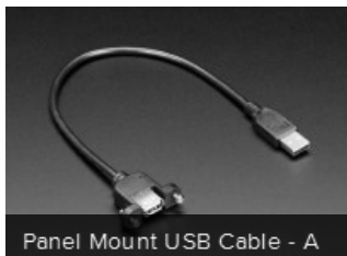
Panel Mount USB Cable - A