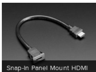
Snap-In Panel Mount HDMI