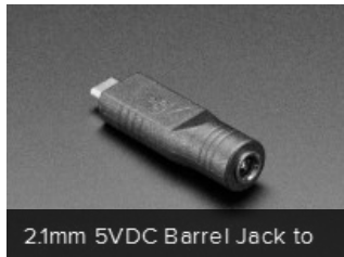
2.1mm 5VDC Barrel Jack to