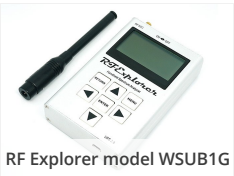
RF Explorer model WSUB1G