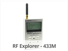
RF Explorer - 433M