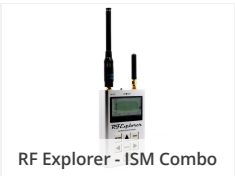
RF Explorer - ISM Combo