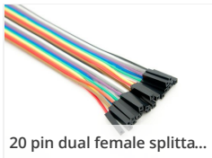
20 pin dual female splitta...