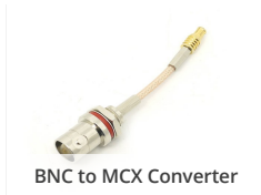
BNC to MCX Converter