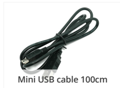
Mini USB cable 100cm