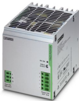
Primary-switched TRIO POWER power supply for DIN rail mounting, input: 1-phase, output: 48 V DC/10 A

Please be informed that the data shown in this PDF document is generated from our online catalog. Please find the complete data in the user documentation. Our general terms of use for downloads are valid.